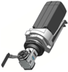
code AS38A00070 fixed unit + Ø270mm blade