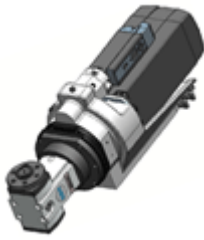
code H6314H0674 rotation 0°-360° + Ø270mm blade