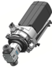
code H6314H0478 rotation 0°-180° + 2 collets ES32